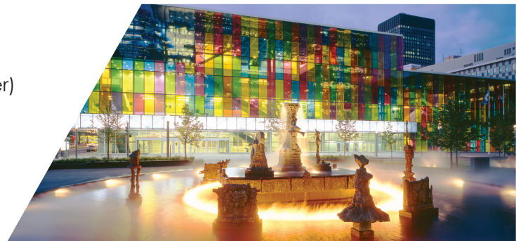
Palais des congrès de Montréal, site of JSM 2013

For more Info Contact Sowmya R Rao Sowmya.Rao@umassmed.edu