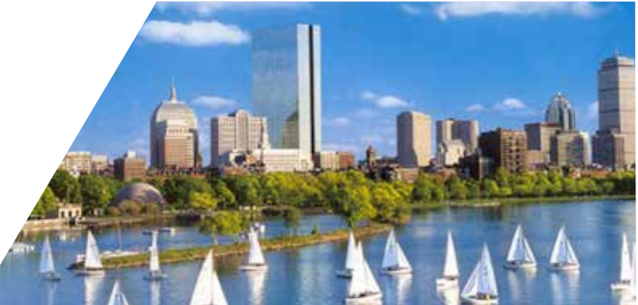
Boston MA, Site of JSM 2014

We are seeking volunteers to staff the IISA booth at JSM. Contact to schedule a time Sowmya.Rao@umassmed.edu