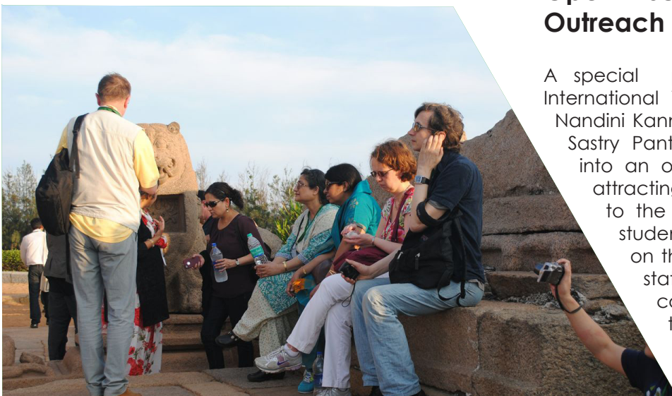
Participants on their visit to Mahabalipuram