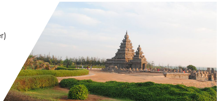
Mahabalipuram, Chennai, India