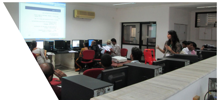
Workshop on Introduction to R

More than 70 students (mostly from India) participated in four workshops on Clinical Trials, R-programming, Shape Restricted Regression and Personalized Medicine. Most had never been exposed to real-world problems involving statistical design, modeling and data analysis. This first exposure helped them realize that a career in statistics can be both lucrative and intellectually satisfying.