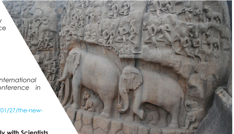
Mahabalipuram, Chennai, India

http://www.thehindu.com/sci-tech/statisticians-are-an-integral-part-of-clinical-trials/article4290659.ece