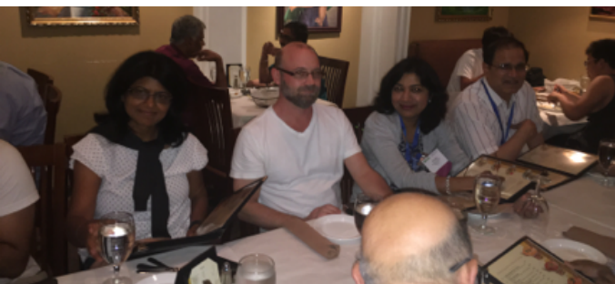
IISA dinner at Chicago Curry House during JSM