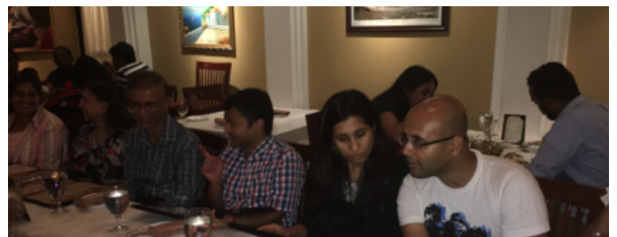
IISA dinner at Chicago Curry House during JSM