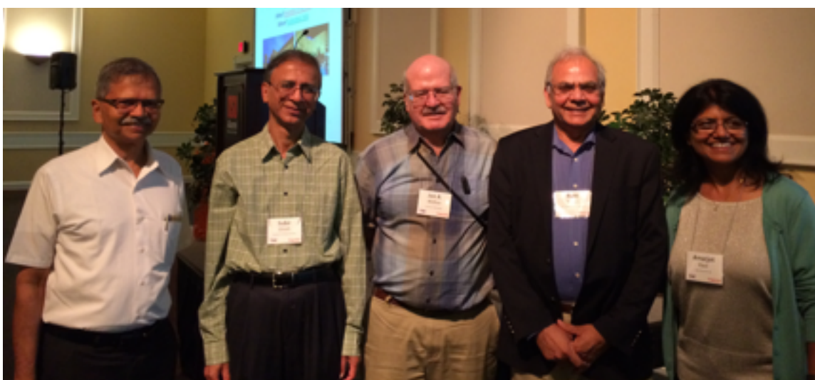
Past and Current Presidents of IISA and IMS at 2016 IISA Banquet, Corvallis, Oregon

One important question is what was the start date of the IISA. As the first committee office bearers were "elected" in November 1993, in my opinion, this was the beginning of IISA. If so, we will have its Silver Anniversary in 2018. Perhaps it is worth pondering on how best to celebrate. Could there be a bigger conference, more awards of recognition, a souvenir issue of some form...? Lots of questions to think about!