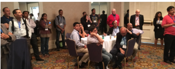
IISA mixer at JSM

Hebrew University of Jerusalem (now at University of Michigan), spoke on complex empirical Bayes models for Gaussian data with applications to archaeology. The second talk by Samuel Kou from Harvard University addressed the problem of optimal shrinkage in heteroscedastic hierarchical models with non-Gaussian data where a class of shrinkage estimates that are asymptotically optimal can be constructed by minimizing an unbiased risk statistic. Eitan Greenshtein from Central Bureau of Statistics, Israel talked about a general method of improving common estimates of a Gaussian mean vector using empirical Bayes techniques. The final talk of the session was given by Lawrence Brown from the University of Pennsylvania and concerned empirical Bayes methodology for a modern 'big-data' incarnation of the so-called news-vendor problem where the goal is to develop a data-driven policy that minimizes total inventory and lost sales costs.