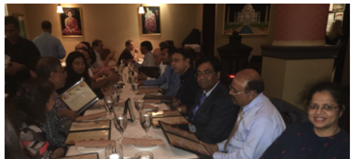
IISA dinner at Chicago Curry House during JSM