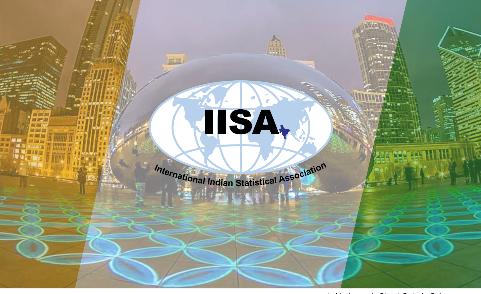
Anish Kapoor's Cloud Gate in Chicago