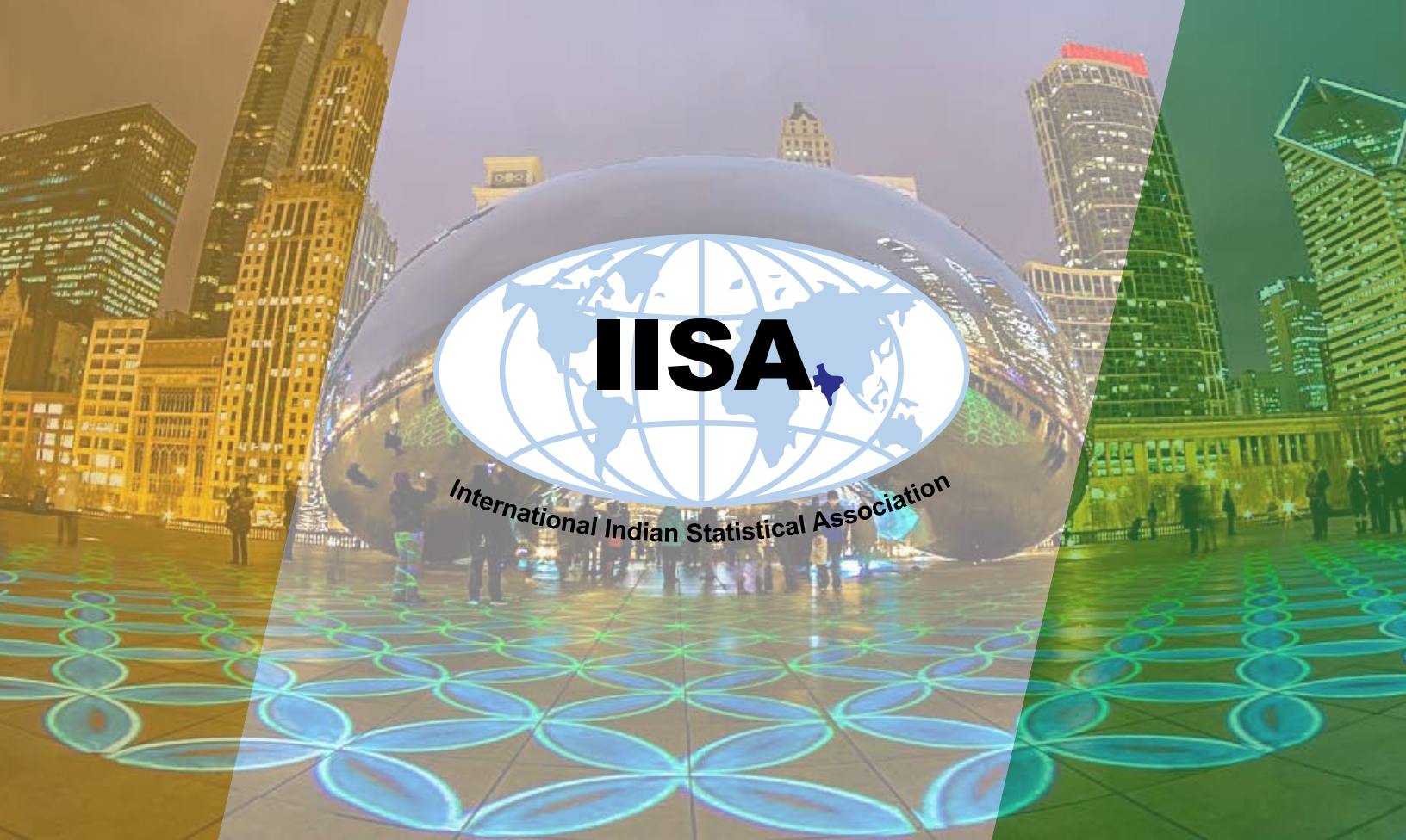
Anish Kapoor's Cloud Gate in Chicago